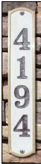
Knollbrook Vertical 3-1/4" x 19"