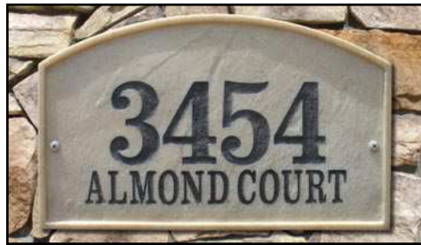
Riviera Arch (15" x 9")