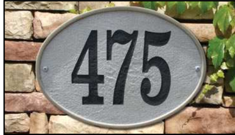
Oakfield Oval (14" x 10")