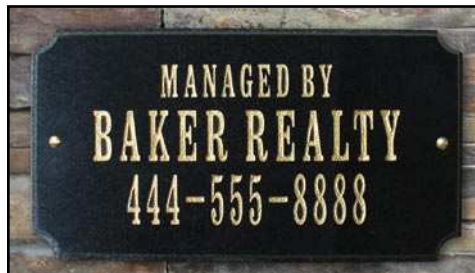
Executive Rectangle (13" x 7")