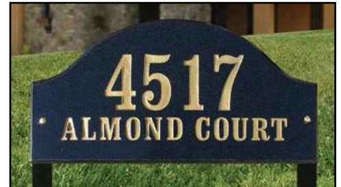
Ridgecrest Arch (15" x 7-3/4")