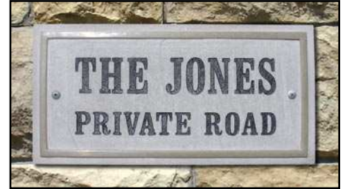
Chesterfield Rectangle (15" x 7-1/2")