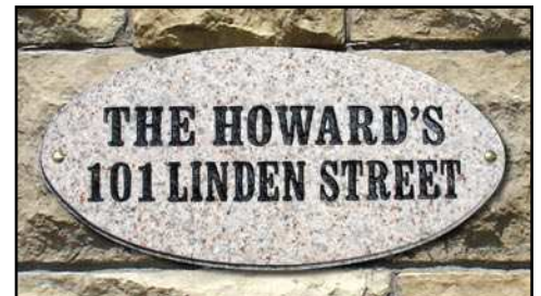
Rockport Oval (15" x 7")