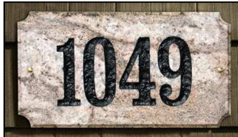
Executive Rectangle (13" x 7")