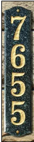
Wexford Vert. 4" x 19"