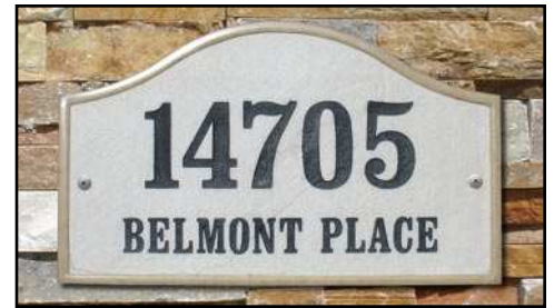
Verona Serpentine (15" x 9-1/2")